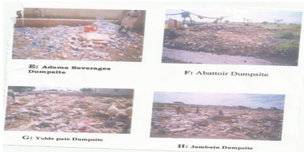
Figure 2: Samples of other solid waste dumpsites at Abattoir, Yolde Pate, Jambutu and Adama Beverages.