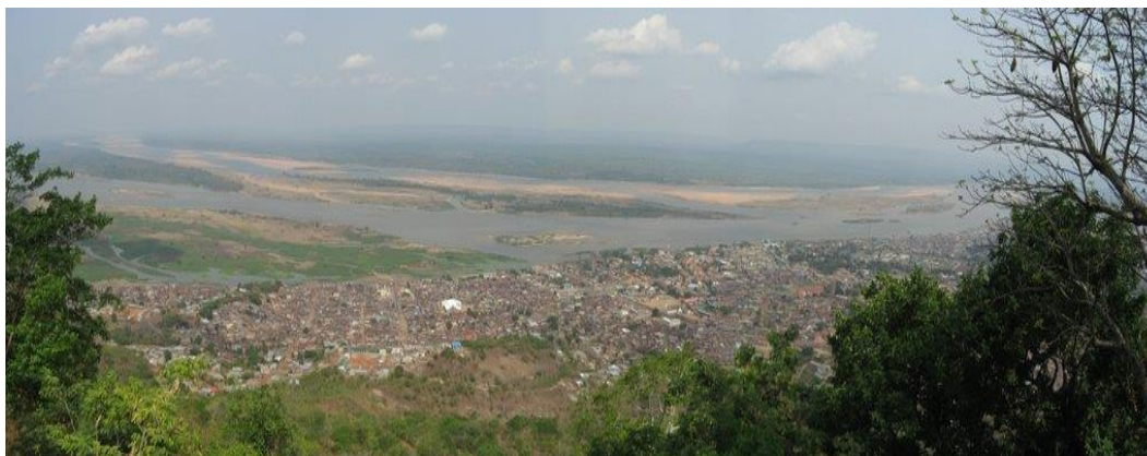
Figure 1: Solid waste dumpsite at Shinko near River Benue

Methods: Leachate, the liquid formed from water that trickled through the solid waste dumpsites was collected in clean washed BOD and plastic bottles for laboratory analyses of pH, total hardness, calcium, magnesium, sodium concentration, total dissolved solid, nitrate and total alkalinity. On the site interviews with residents of sampled areas and some government officials about solid waste generation, collection and disposal was employed in this study